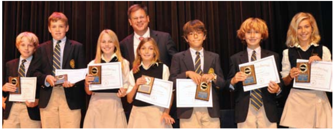
5th Grade Ones in Consideration - All four quarters