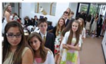
Eighth Graders lined up before the ceremony that would include recognition of their years at PBDA.

The current 9th Graders are all moving on, of course, and they are the main focus of the day. Their send-off includes individual