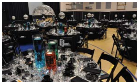
Working with a disco theme, the decorating committee turned the Halmos Activities Center into a 70's Disco Club.