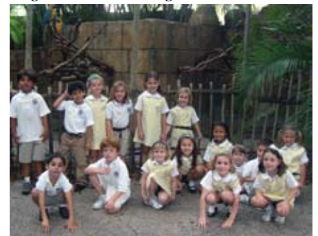
Kindergarten 106 enjoyed a day at the Palm Beach Zoo learning about South American animals.