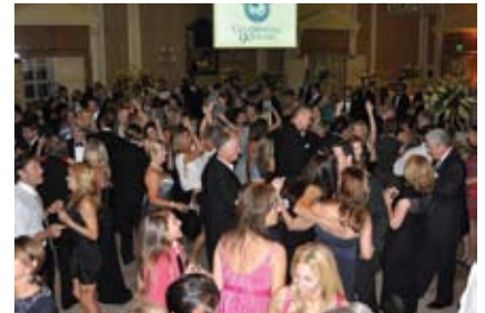
The spectacular evening ended with dancing.

Throughout this auction season, our school has, once again, shown itself to be