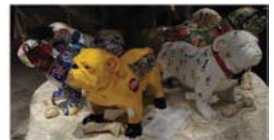
Class project bulldogs awaited auctioning.