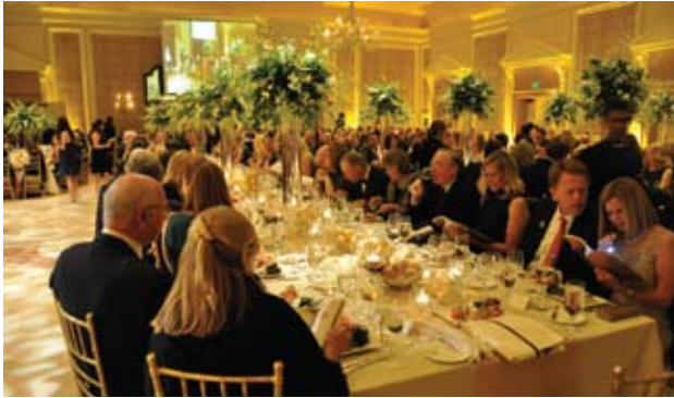
Auction guests enjoyed a delicious Breakers' dinner during the Live Auction.

The walk from the desks to the Silent Auction in the Mediterranean Ballroom saw most guests slowly moving from one happy greeting to another as faces from the past were suddenly recognized.