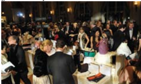
The Silent Auction in the Mediterranean Ballroom offered quality items and opportunities.

But, perhaps the greatest testimonial to the school's cherished history was the guest list itself. The school's 90th Anniversary is an occasion to celebrate and many former trustees and parents were determined not to miss this event. Those with long associations with the school enjoyed reunions that spontaneously enveloped guests as they arrived at the check-in desks.