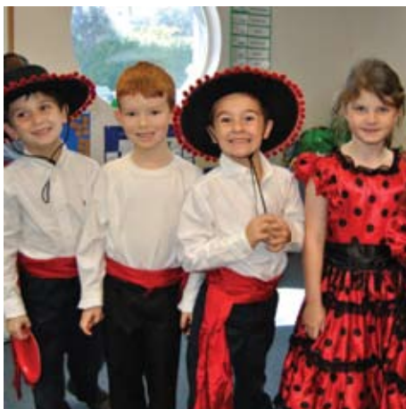
First Grade 101 was all smiles as they presented their village about Spain

PBDA has also partnered with the Palm Beach Zoo to enhance the International Studies Program. Kindergarten and Second Grade students visited the zoo to learn more about the animals on the continents of South America and Asia, the continents being studied at those grade levels.