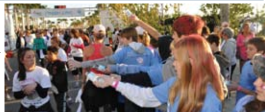
PBDA 8th Graders handed out hundreds of bottles of water at the finish line to support the Race for the Cure.

survivor. Other Palm Beach Day students and alumni ran in the race, sometimes before joining their classmates as volunteers for both the 8th and 5th Grade causes.