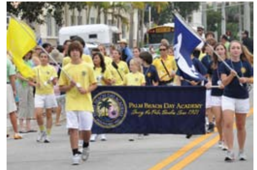
PBDA students lead the procession which followed months of planning on the part of administration and faculty volunteers.

The short march to the Flagler Museum, along a street lined with parade watchers was a memorable walk that commemorated the shared history of our town and our school. PBDA was a proud participant in the events of the day, just as it has been a proud participant in the events of the past 90 years.