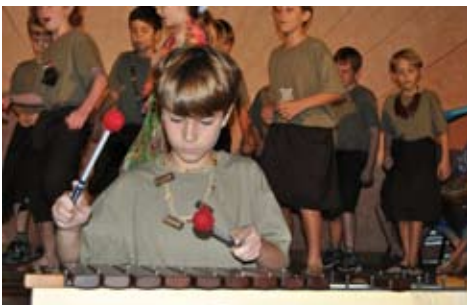
Several Third Graders played percussion instruments while others performed traditional dances of Namibia & Tanzania.

This year's program prominently featured