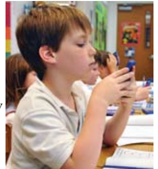
Math class requires some pondering.

However, one of the best parts of being a Second Grader at PBDA is the leadership role the children assume with respect to recycling and sustainability issues. Second Graders are the ecology leaders on campus and can be seen dutifully taking care of emptying the recycling bins and caring for the reading garden. They take this job very seriously and are role models to those around them. This opportunity for leadership, an important aspect of the educational experience at