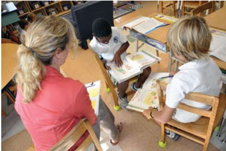
The two-teacher model allows for individualized attention.

an essential concept or question. The 2nd Grade team of six teachers also collaborates with special area teachers whenever possible to provide additional, rich