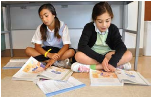
2nd Grade readers enjoy their reading sanctuaries.

For example, when our 2nd Graders study the concept of camouflage, they don't simply read about it in their