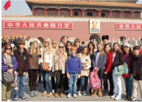
Eighteen PBDA students and teachers outside the Forbidden City.

teachers at Alliance. March 16, we flew to Beijing, where we toured Tiananmen Square, Forbidden City, and The Great Wall of China. We visited our friends at Living Hope Orphanage and immediately recognized familiar faces that we met this past October when they were here with us at PBDA. After greetings and introductions, we saw new cultural dances performed by young students who had been practicing for just under a week. They were fabulous! We taught English classes, participated in arts and crafts activities and spent time on the basketball court with seventy-two children that we are beginning to recognize as true friends, half a world away.