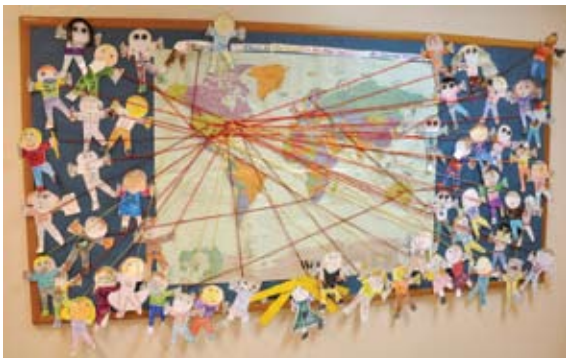
Flat Stanley's travels were documented on a bulletin board.

Palm Beach Day Academy, will serve them well as the “campus leaders” next year in Third Grade and in all the grades beyond.