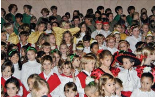
All Lower Campus students performed at the International Day Celebration

Second graders performed interesting numbers from South Korea, Indonesia, and Malaysia. In addition to the languages of music and dance, one class chose to tell a traditional folk tale using the medium